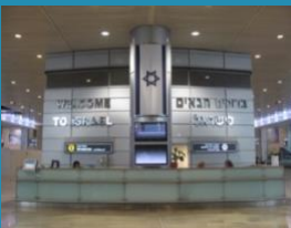
Ben Gurion Airport, Tel Aviv